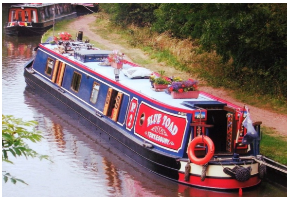
The beautiful Blue Toad