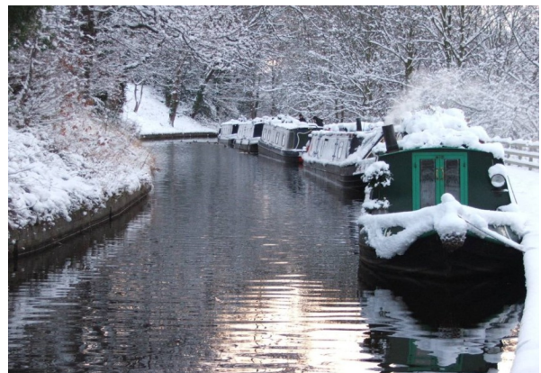
Winter in Llangollen