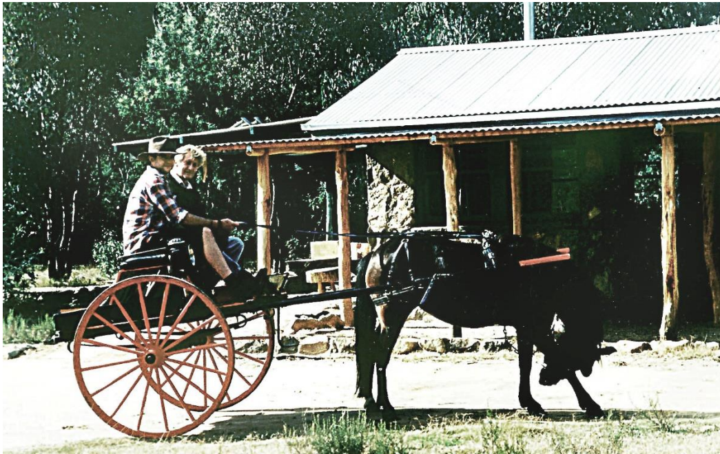
Noonameena – My sleeping place in the bush, NSW

As a young married woman I spent time in Sweden, Canada, USA, Australia and New Zealand; raised a family of 3 girls and worked as a librarian, a Hairdresser/Salon owner, a Pharmacy Assistant and a Bookseller. Now living Low Head where my ancestors were early settlers, I will be inviting you to share the lives of various TVU3A members through this column.